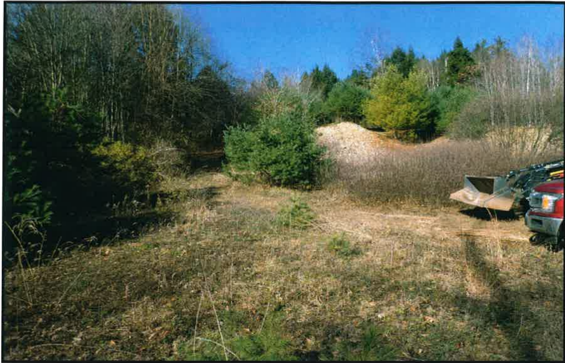
Photograph 1 – View of the sand and gravel bank.