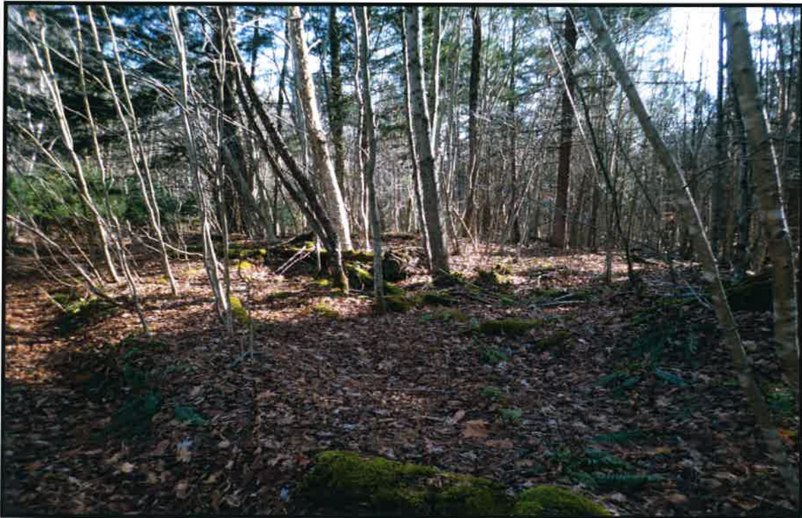
Photograph 4 - View of the area to the southeast.