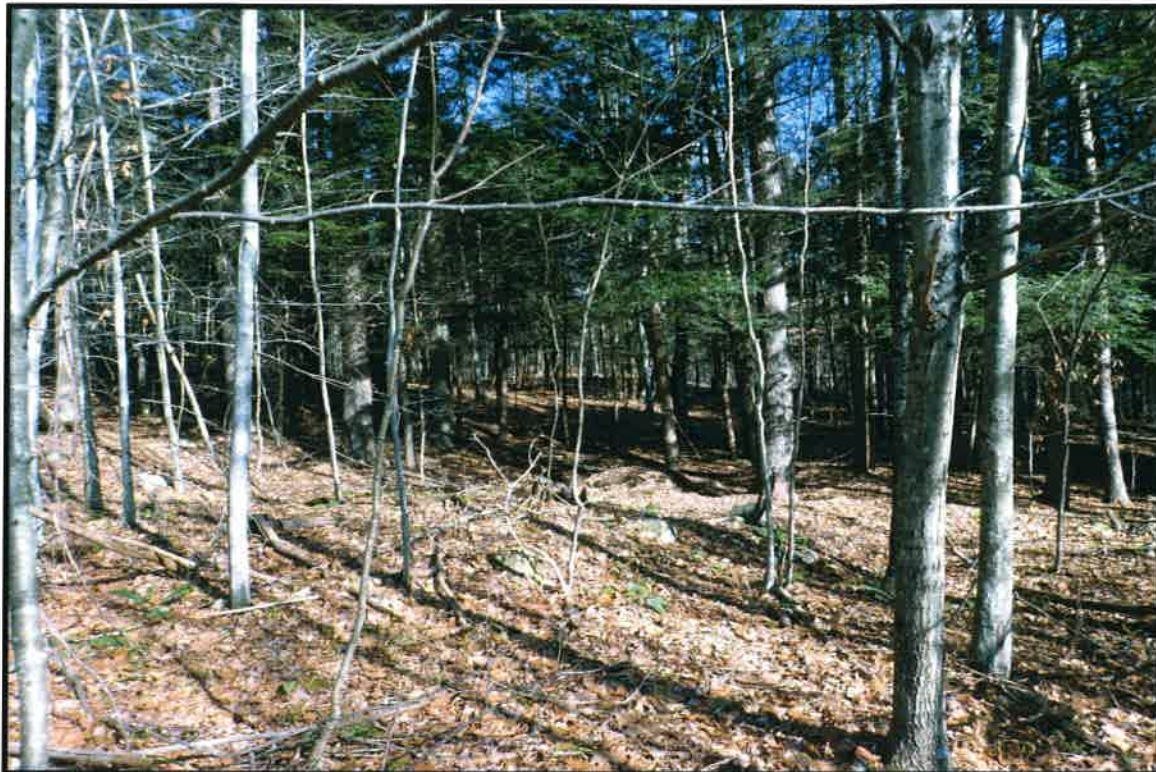
Photograph 5 - View of the land to the east.