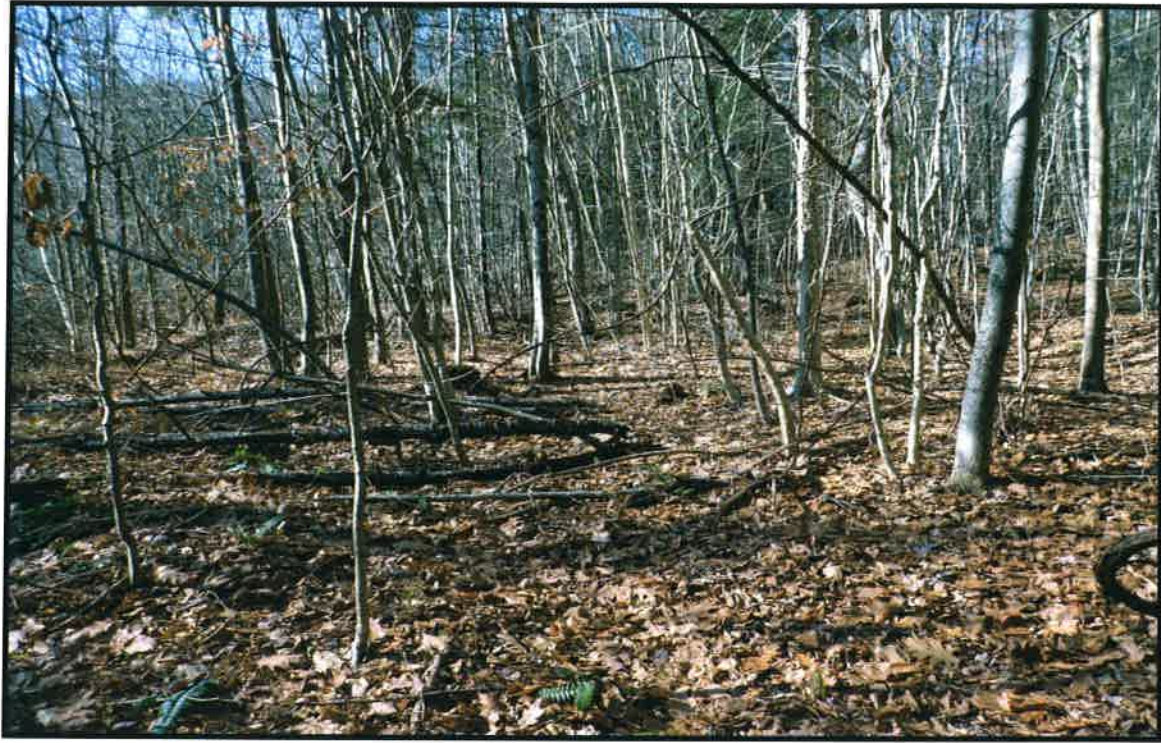
Photograph 7 -View of the land to the north and upslope.