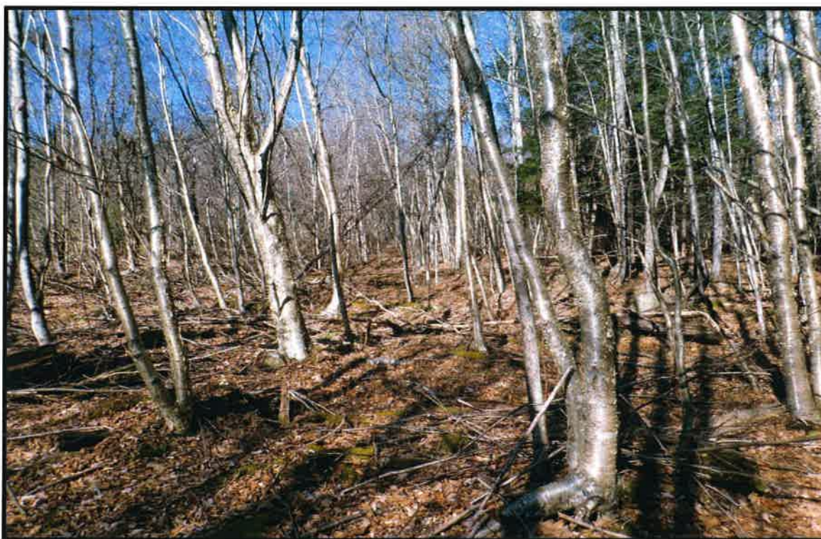
Photograph 6 - View of the land to the northeast.