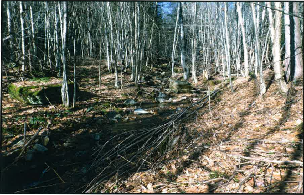
Photograph 3 - View of the delineated and mapped stream to the south.