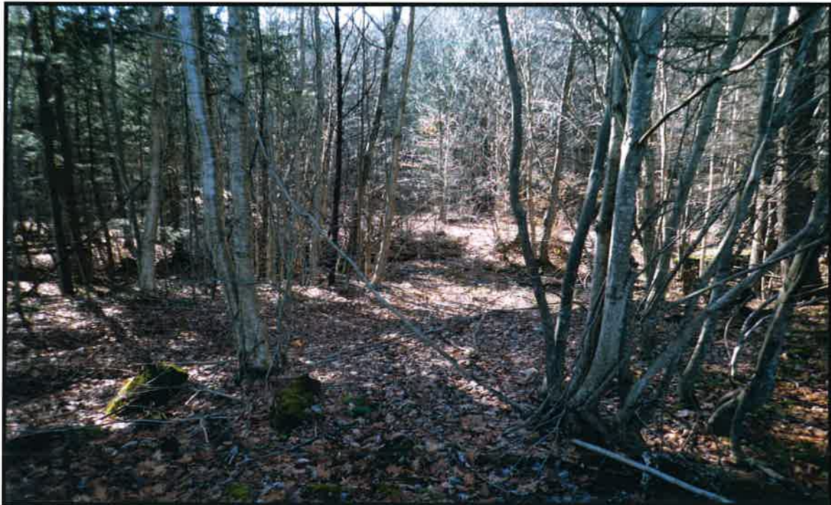
Photograph 2 – View looking south and toward the delineated and mapped stream.